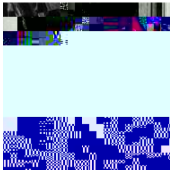
Athabascan woman stitching a birch bark basket.

Dené (Athabascan) basket makers are aware of birch bark's ability to hold water. They collect birch bark in the spring or early summer, taking only the outer layer so that the tree will survive. The bark is cut, warmed to make it flexible, folded into shape, and stitched together with split pieces of root from spruce or willow trees. Baskets are made in a variety of shapes and sizes for different purposes.